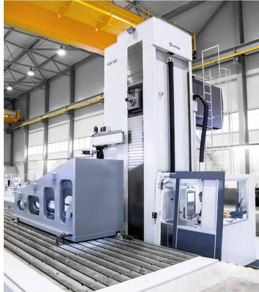
The PR series horizontal boring and milling machines are the ideal machine tools for machining large components

This is the second Union machine for Prairie Machines. The customer was ultimately won over by the quality of the boring mill already purchased and the on-site service provided by our Herkules USA subsidiary in North America.