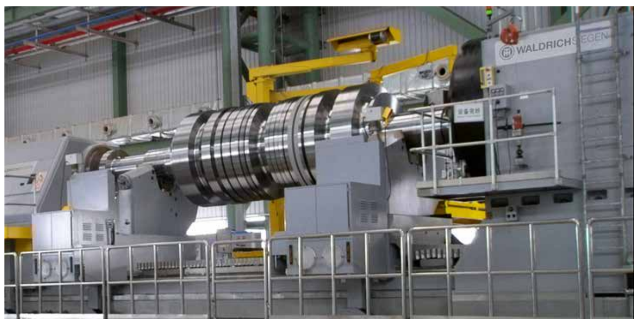
The ProfiTurn H excels in quality and accurate machining results

The ProfiTurn H is already the third machine of this type for Harbin Electric. The extremely precise machining as well as the high quality and reliability of the machines already operating in the plant have convinced Harbin Electric to once again invest in a machine from WaldrichSiegen.