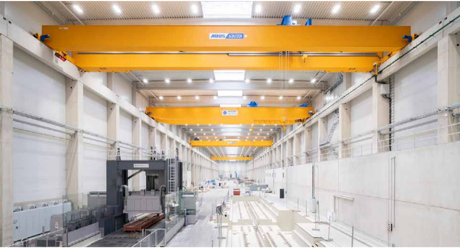
Impressive dimensions – The XXL heavy-duty machine tools from WaldrichSiegen will be built in the new production facility in the future