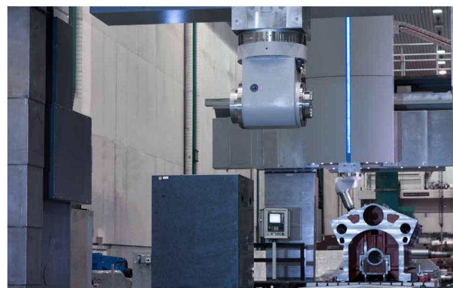
A wide range of accessories allows high machining flexibility