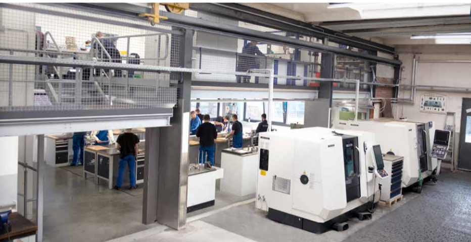
The training center in Siegen offers apprentices a modern environment