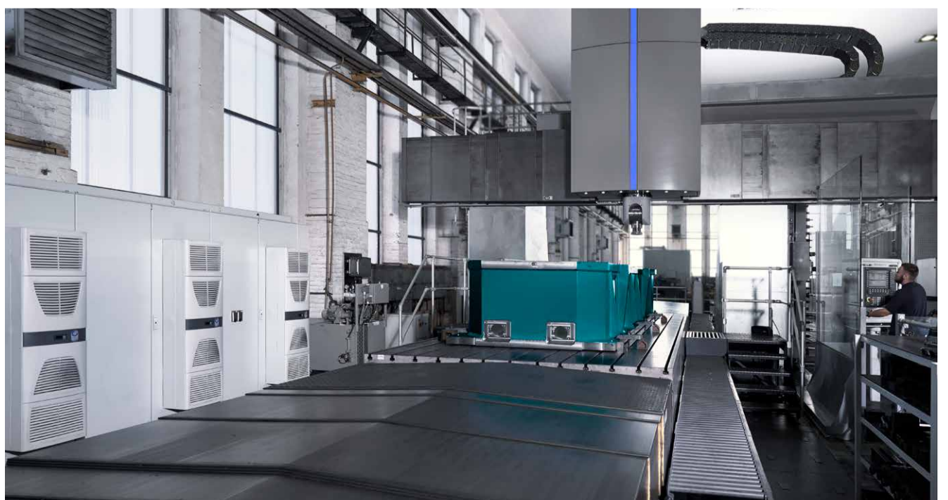
The ProfiMill compact is ideally suited for machining small- and medium-sized workpieces

For the customer, the flexibility in the customer-specific machine design of the ProfiMill compact and also the use of common parts for cost-effective stocking of spare parts were important. The quality of the service and the machines were the key factors for the customer to decide in favor of WaldrichSiegen – and this outstanding quality was also offered to the customer 100%.