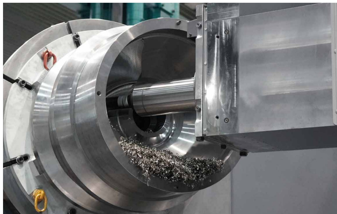
The Union boring mill KCS 150 reaches a new level in the field of 5-axis machining

The boring mill is also equipped with an automatic tool and milling head changer for a fast and efficient change of 3 milling heads and 120 tool pockets. This enables the customer to manufacture complex workpieces, such as impellers, in-house without having to rely on an external supplier.