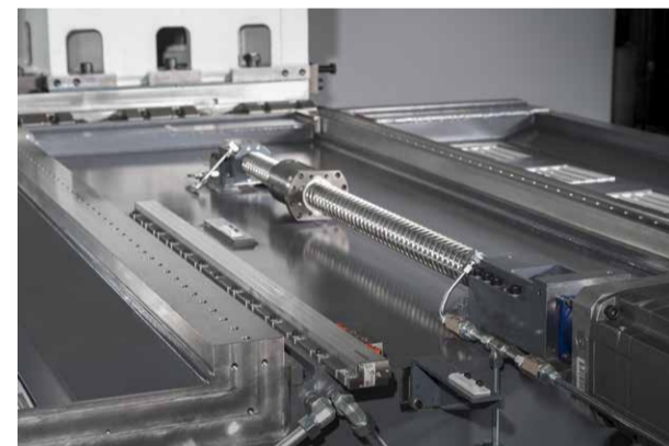
The thermal management of the TMG 125 ensures lowest machining tolerances

In addition, a lateral milling head, 3D tool measurement and video monitoring of the work area will be used for the TM 125, which Nomet Oy has not found in this combination on any other machine currently on the market that would meet the necessary performance requirements for machining workpieces.