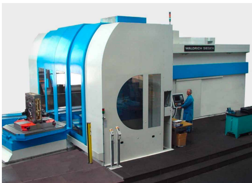
Extensive upgrades to the \mu PM 1,500 horizontal high-precision machining center from WaldrichSiegen