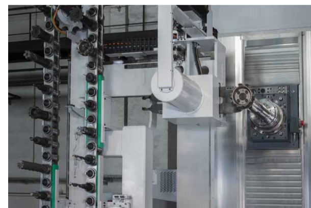
Automated tool change for high machining speed