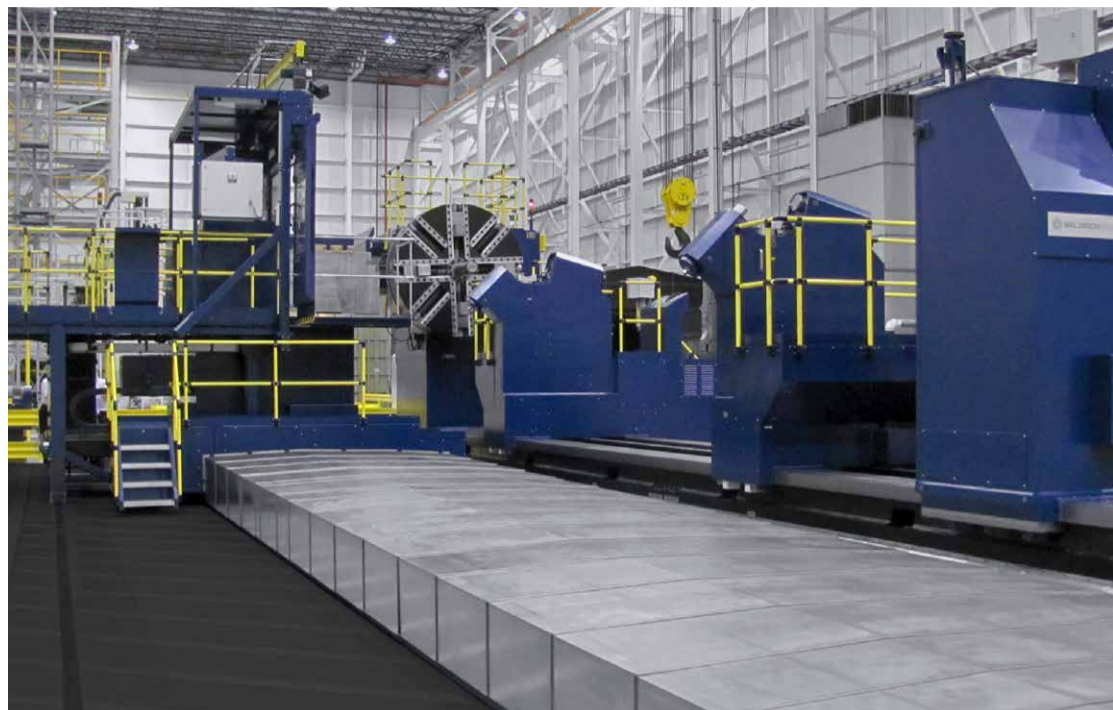
Upgrade and relocation of the world's largest lathe optimizes manufacturing capacity at the new location in France

In addition to the relocation and installation of the machine in France, an upgrade of the machine control system has also been carried out. Also, the electrical components were adapted to the European power grid and local conditions. We thus ensure the optimum solution for our customer even under complex conditions.